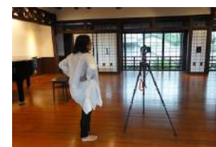
Artist : Sutapa Biswas (England) Year : 2015