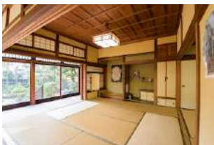
Artist : Nerhol (Japan) Year : 2018

“KASHIMA BEPPU ARTIST IN RESIDENCE” is a residence program that BEPPU PROJECT hold in Beppu since 2008. In Japanese, “KASHIMA” refers to the name of the place where you stay when you heal your body and soul in a bath/spa area. One of the aim of residence is to promote and develop, in connection with local community, the artist and creation.