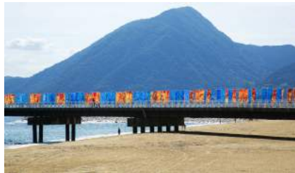
Artist : Christian Marclay Year : 2012