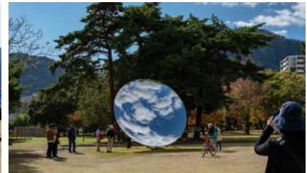
Artist : Anish Kapoor Year : 2018 Sky Mirror, 2018