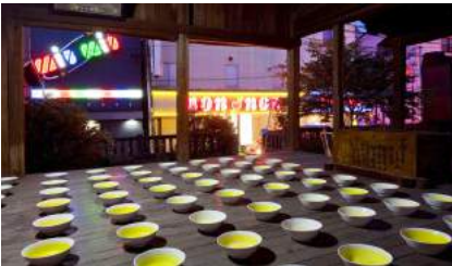
Artist : SARKIS Year : 2009